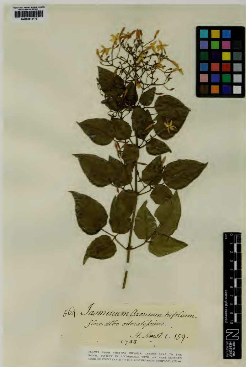
Figure 6.- Specimen of Jasminum azoricum (Madeiran endemic) from the living collections of Chelsea Physic Garden that was sent from this botanic garden to the Royal Society in 1733 (RAND [65]).

were received by the Royal Society between 1722 and 1753 (STUNGO [83]). These specimens now form part of the herbarium of the Natural History Museum in London (BM) (Figure 6). The “ Philosophical Transactions ” of the Royal Society regularly published articles listing the specimens that were received annually from Chelsea Physic Garden. In eight of these articles (MILLER [46-47]; RAND [65-67]; SLOANE & RAND [79]; WILMER [95-96]) Macaronesian specimens are listed.